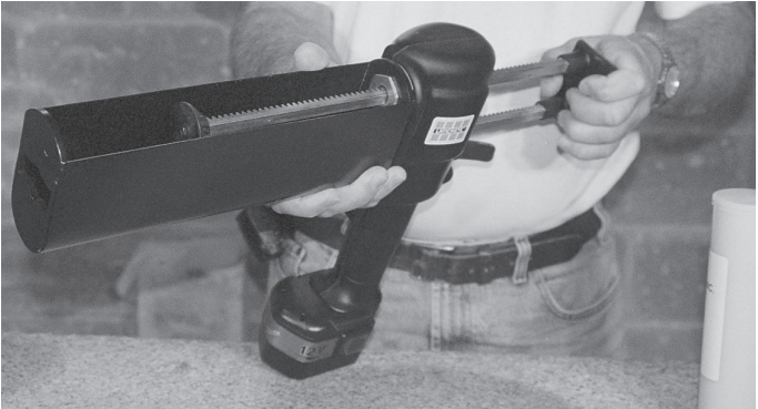
5.1 Open clutch lever, grasp rack handle and pull outward until fully open.